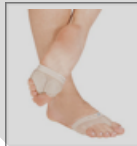
Tap 1/2, 2/3 & Creative Dance