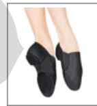
Tap A, B, C, & Advanced Class