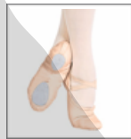
Contemporary (either one is fine)